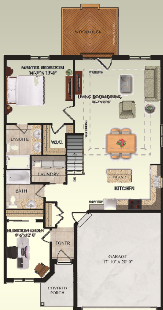
RIGHT END/CENTER UNIT LAYOUT 1340 sq ft 390 sq ft GARAGE